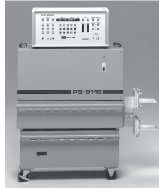
Model PS-9116 with Model AT-5 Input Autotransformer

The transport cart is a mobile base that supports Model PS-9116. This allows the test set to be rolled from one test site to another.