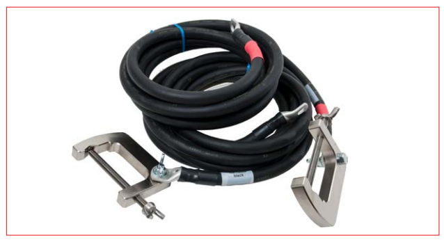
Cable set (GA-12052) 2 x 5 m (16 ft)

The Current Transformer (CT) Switchbox for INGVAR is a tool that is used to facilitate CT testing. The secondary windings on the CT are connected to the CT Switchbox inputs and the CT Switchbox output is connected to INGVAR Ammeter 2 terminals. The switch on the CT Switchbox is used to select which secondary winding on the CT that should be measured. The windings that aren't measured are shortcircuited. The CT Switchbox can handle up to 5 secondary windings.