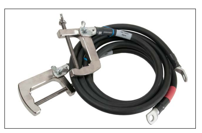
Cable set (GA-12051) 2 x 2 m (6.5 ft)