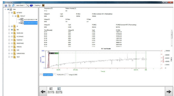
DC test results